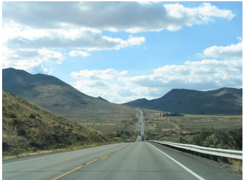
Beckwourth Pass, as it looks today

In 1850 he discovered a pass through the Sierra Nevada Mountains that was a safer and faster route for pioneers trying to reach California during the Gold Rush. That pass became the Beckwourth Pass and is part of the United States Interstate Highway system.